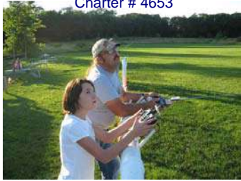
Hands on flight training!