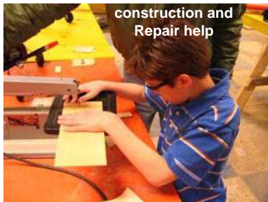
construction and Repair help

The Hawks program is a not-for-profit organization made up of local hobbyist providing, as a public service, free radio control flight training to area youth. There is no charge to join or fly, kids learn at their own pace and they can enter or leave the program at any time they wish and are under no obligations.