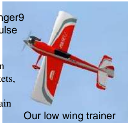
Our low wing trainer

Look us up on Facebook "Hawks Junior Aviators"