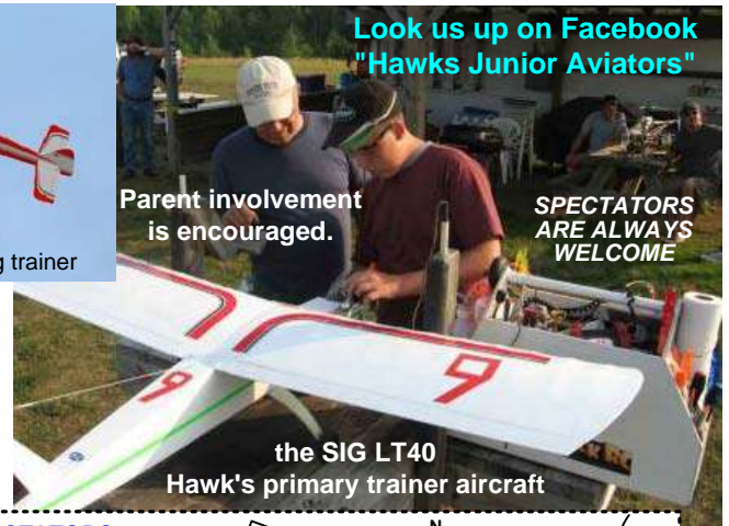
the SIG LT40 Hawk's primary trainer aircraft

Tuesday evenings from 6 to 8pm and Saturday afternoons from 1 to 3pm. (weather permitting of course)